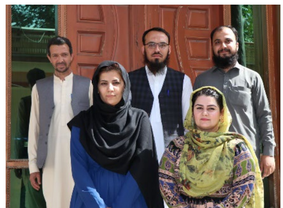
ORCD research team, Afghanistan

D4I awards small grants to universities and nongovernmental organizations (NGOs) in USAID PRH-priority countries to conduct family planning-focused research projects of their design. The Central Institute of Science and Technology (CiST) in Nepal, the Health Policy Research Group (HPRG) at the University of Nigeria, the Department of Population Science and Human Resource Development at the University of Rajshahi in Bangladesh, and the Organization for Research and Community Development (ORCD) in Afghanistan were supported with tailored mentorship throughout the research process. Participants in the program reported gaining experience with qualitative and fiscal space analysis, as well as writing and program management.