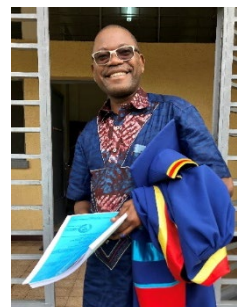
The Dean of KSPH

Strengthening university-based evaluation capacity in the Democratic Republic of Congo: In the Democratic Republic of Congo (DRC), D4I partnered with the Kinshasa School of Public Health (KSPH) to conduct an evaluation the country’s Integrated Health Program. In addition to collaborating on core elements of the evaluation, D4I worked with KSPH to design a capacity strengthening plan centered on KSPH’s priorities for strengthening evaluation and research skills. This included new modules for KSPH’s existing web-based learning platform, a resource library, and an online